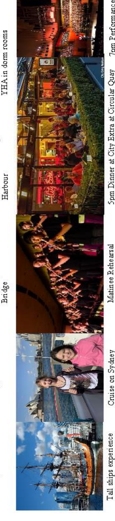
Tall ships experience