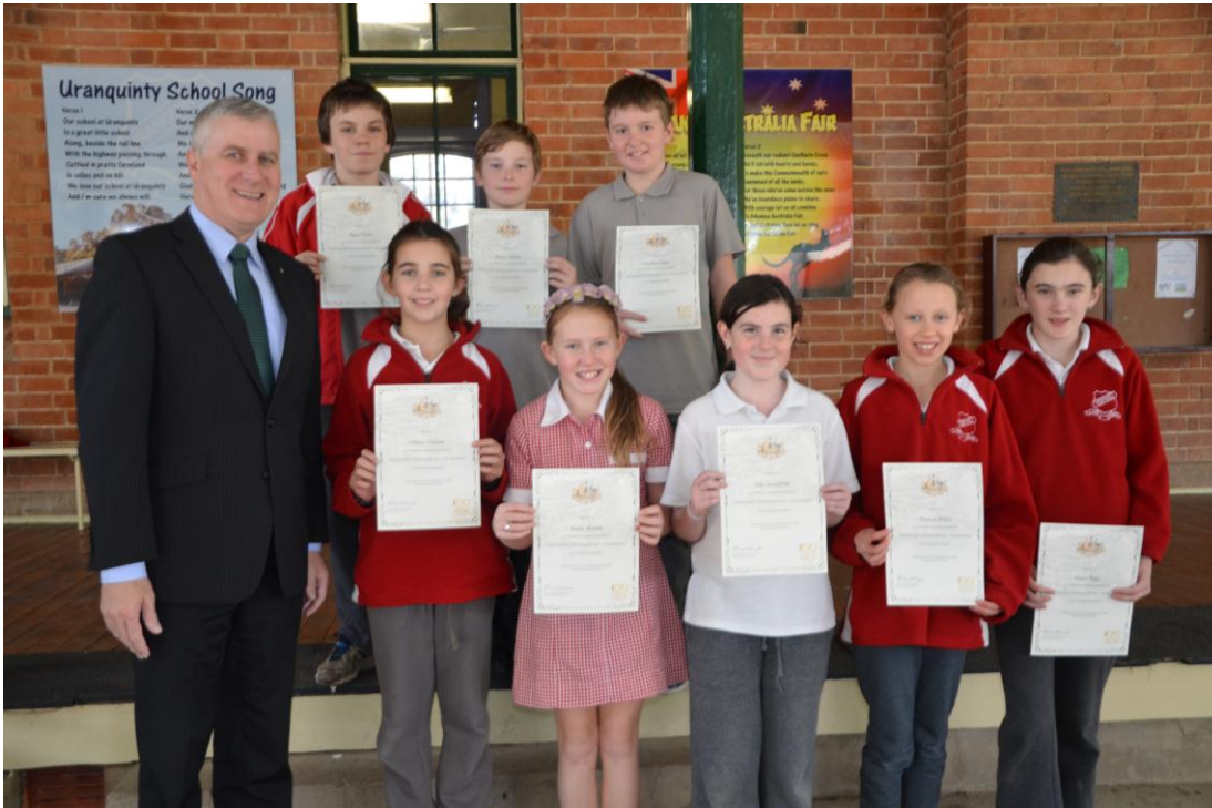
The Hon Mr Michael McCormack - MP, Nationals Member for Riverina visited UPS to present students with awards for their Anzac Day Writing.