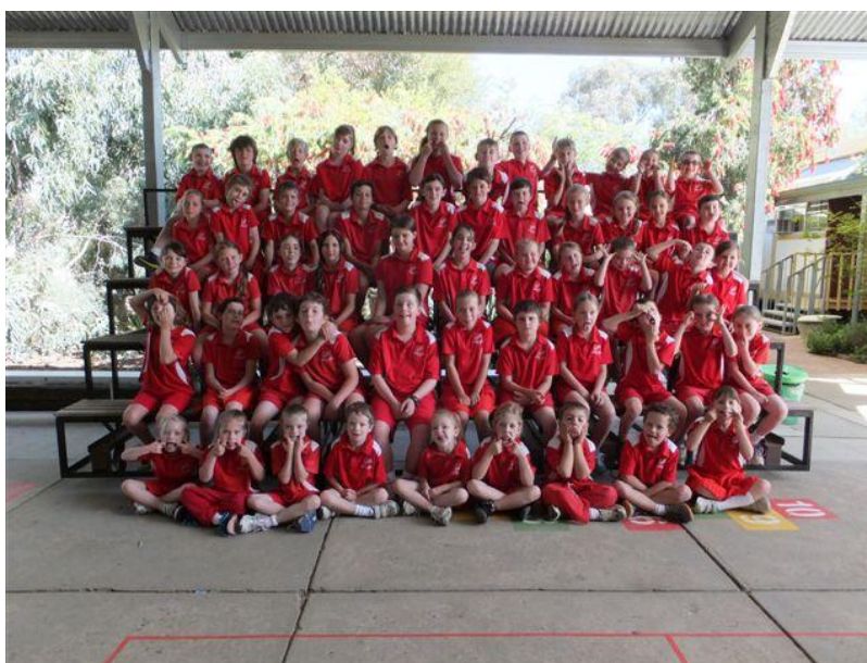
We had fun having our photos taken for the School Calendar